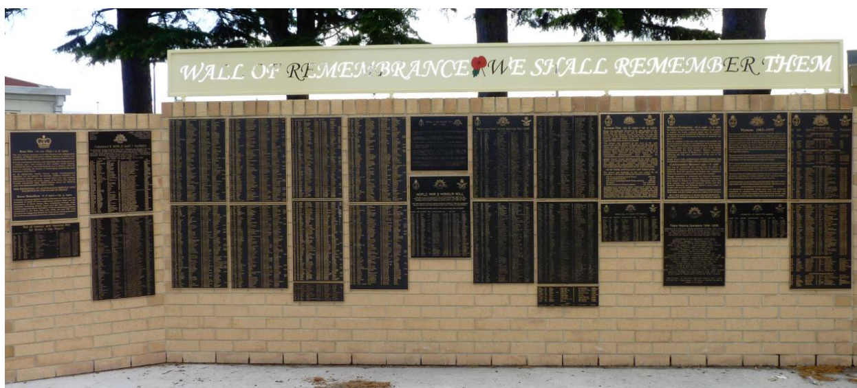
Wall of Remembrance, St. Helens, Tasmania

"What these men did nothing can alter now. The good and the bad, the greatness and the smallness of their story will stand. Whatever of glory it contains nothing now can lessen. It rises, as it will always rise, above the mists of ages, a monument to great hearted men; and for their nation, a possession forever."