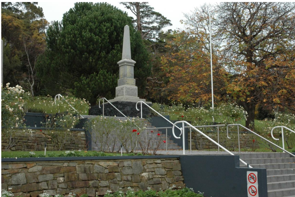
Burnie War Memorial