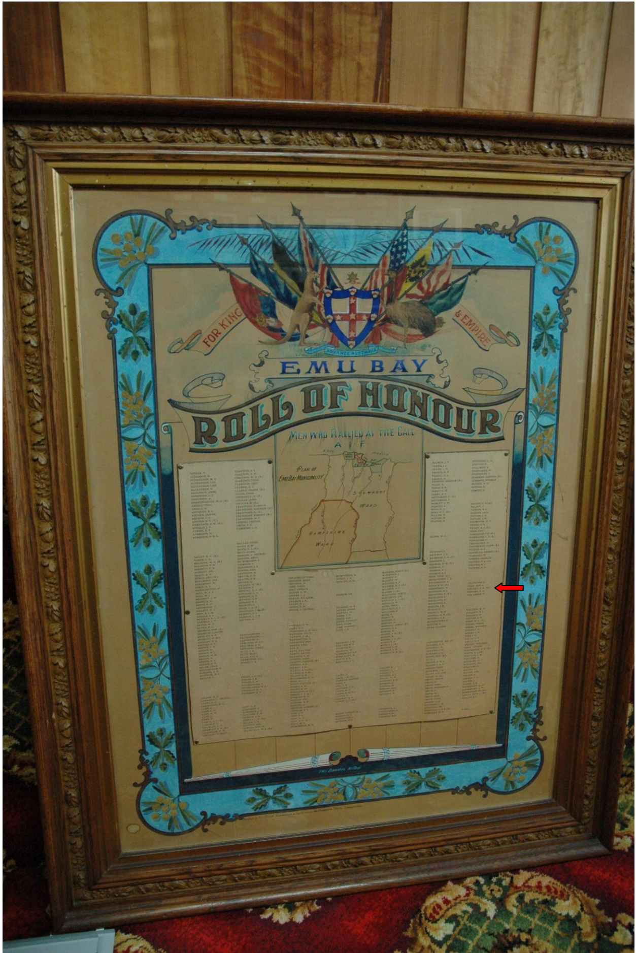
Emu Bay Roll of Honour